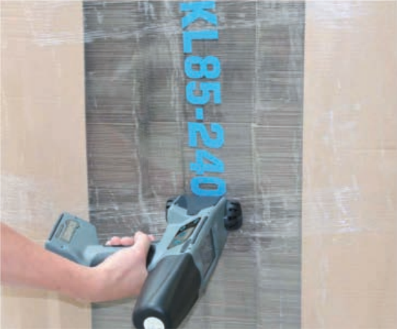
Prints on stretch wrap with pigmented ink

In addition, the MARK JET 2600 makes available a number of practical accessories to maximize the function of the unit. These include print stabilizers, guide wheels, scanners, handy carry bags and holsters, and a growing number of added options.