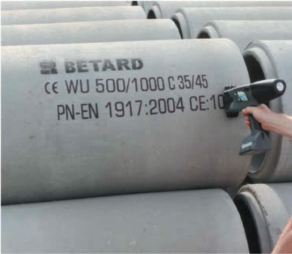
Prints on concrete with special UV-resistant black ink