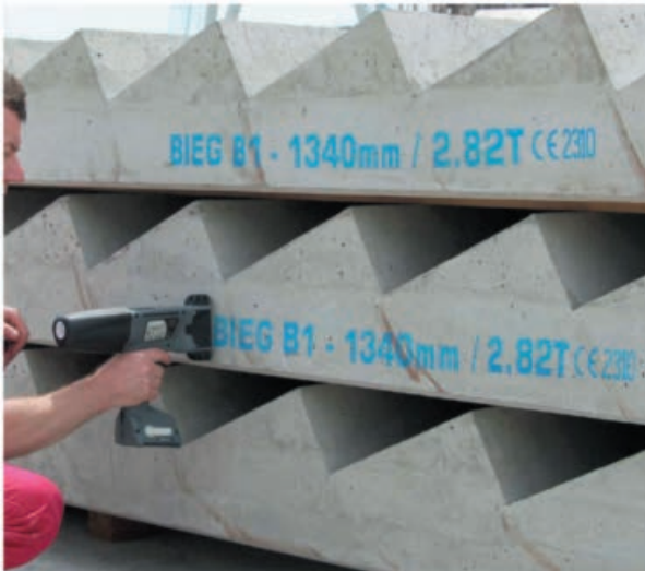
Also prints on concrete with blue pigmented ink