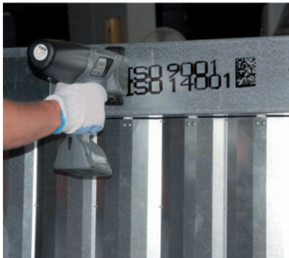
Prints on steel with black universal ink

SCHMIDT introduces the next generation of hand held ink jet printers, the MARK JET 2600 . It provides reimagined features and functionality for even more innovative, portable coding.