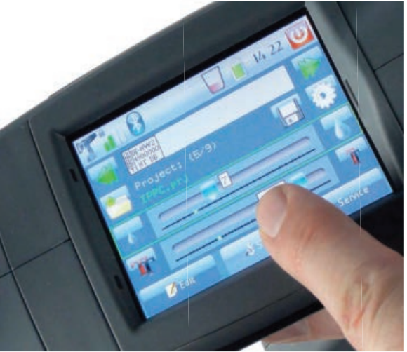
Control and input via touchscreen

For more information on the MARK JET 2600 contact SCHMIDT at 847-647-7117 or www.gtschmidt.com .